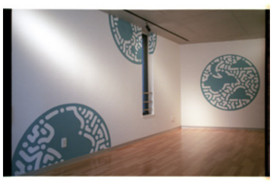
2-A Scandinavian / Art Work by Naoki "SAND" Yamamoto