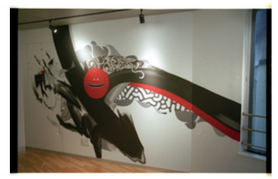
2-B Modern Japanese / Art Work by 81BASTARDS