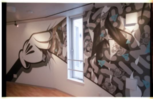
3-B American / Art Work by SLICK & 81BASTARDS