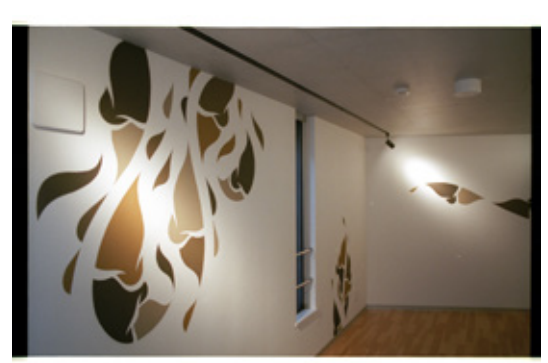
3-A Military / Art Work by MHAK