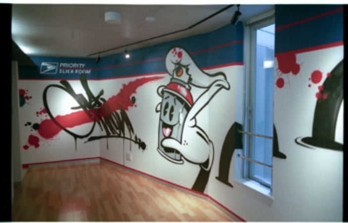
[LEFT] Roof Top / Art Work by SLICK & COOK [TOP] ENTRANCE / Art Work by SLICK, COOK & 81BASTARDS, [BOTTOM] PRIORITY SLICK ROOM / Art Work by SLICK