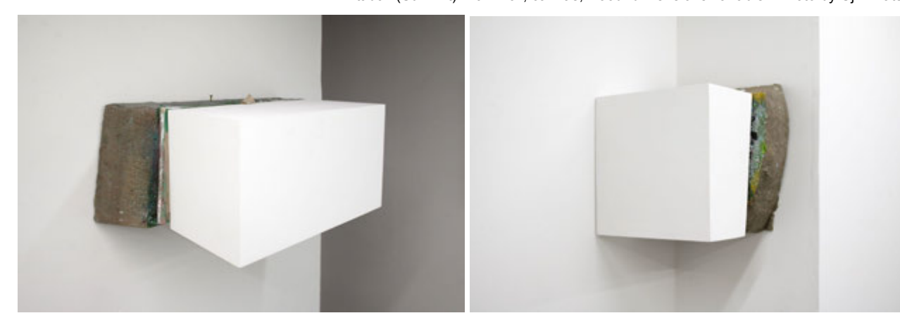
left: "Untitled" 2024 oil and glitter on canvas, wood 250×486×309 mm right "Untitled" 2024 oil and glitter on canvas, wood 282×283×230 mm