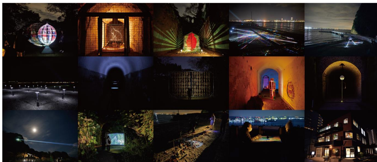
Past Sense Island Exhibitions

General Inquiries | Sense Island Executive Committee Office Yokosuka City Culture, Sports, and Tourism Planning Division 046-822-8427 [Weekdays 9:00 AM - 5:00 PM] senseisland@gmail.com