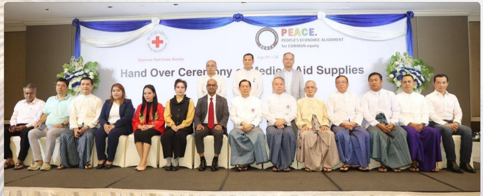
Ceremony attendees included officials from the Ministry of Health, Myanmar Red Cross Society, and private sector figureheads