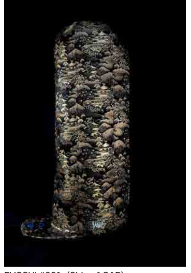
EVOSHi #001 (Side of CAP)

This cap is a fusion of upcycling and contemporary sensibility, crafted by deconstructing vintage wear and old kimonos to give them new life as unique materials. A special piece that effortlessly incorporates art into everyday life, it transforms vintage fabrics and kimono textiles into a new form, adding individuality and storytelling to your style.