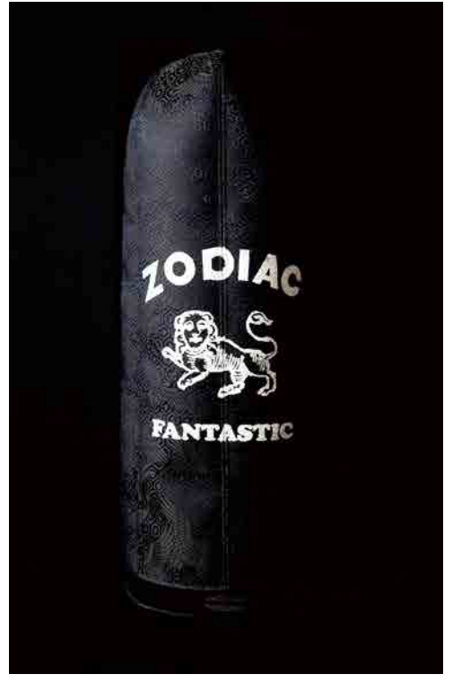
KIMONO ART CAP "ZODIAC" Height: Approx. 53cm | Head circumference: Approx. 56–62cm (roughly M-L) A model crafted using recycled kimono fabric and finished with silk printing.