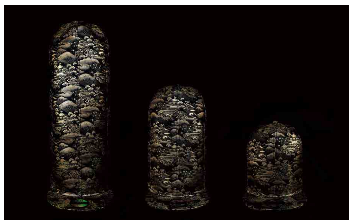
Series name: "EVOSHi" (The photos are for reference; vintage kimono fabric is reused). Custom orders are available for fabric selection, height, and size variations. From left: EVOSHi #001 (height approx. 53cm), #002 (height approx. 35cm), #003 (height approx. 23cm). All have a head circumference of approximately 56–62cm. Sizes can be adjusted and modified up to XXL.

Art of Peace Inc. (https://www.artofpeace.tokyo) is pleased to announce the launch of a one-of-a-kind art cap by W@nder Fabric® founder TOSHi, themed around "Art in Everyday Life." In addition, we are now accepting orders for custom-made caps.