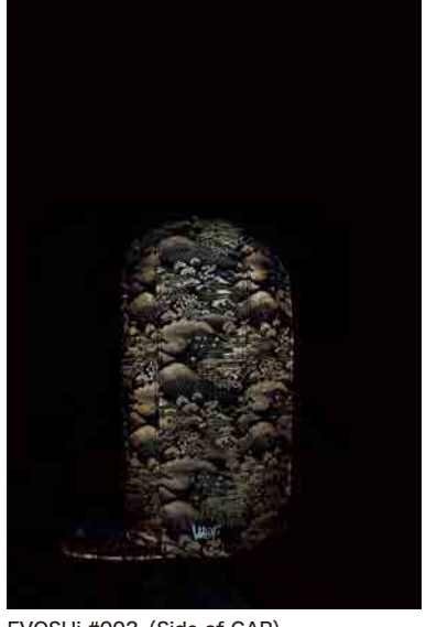
EVOSHi #002 (Side of CAP)