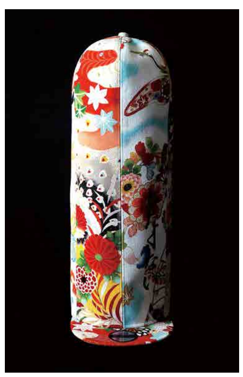
KIMONO ART CAP "HIRAGANA" Height: Approx. 53cm | Head circumference: Approx. 56–62cm (roughly M-L) A model crafted using vintage kimono fabric and finished with silk screen printing.

Art Cap Collection: https://www.toshixxx.com/all-view