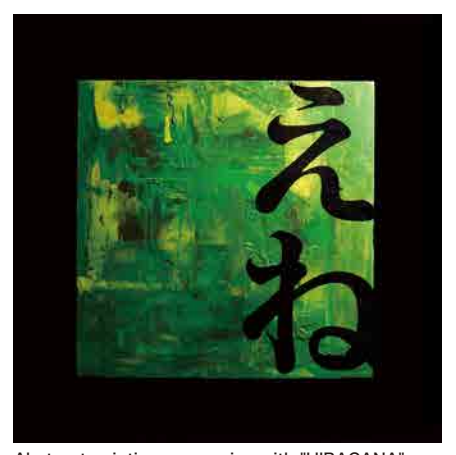
Abstract painting expression with "HIRAGANA" #Green