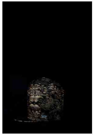
EVOSHi #003 (Side of CAP)