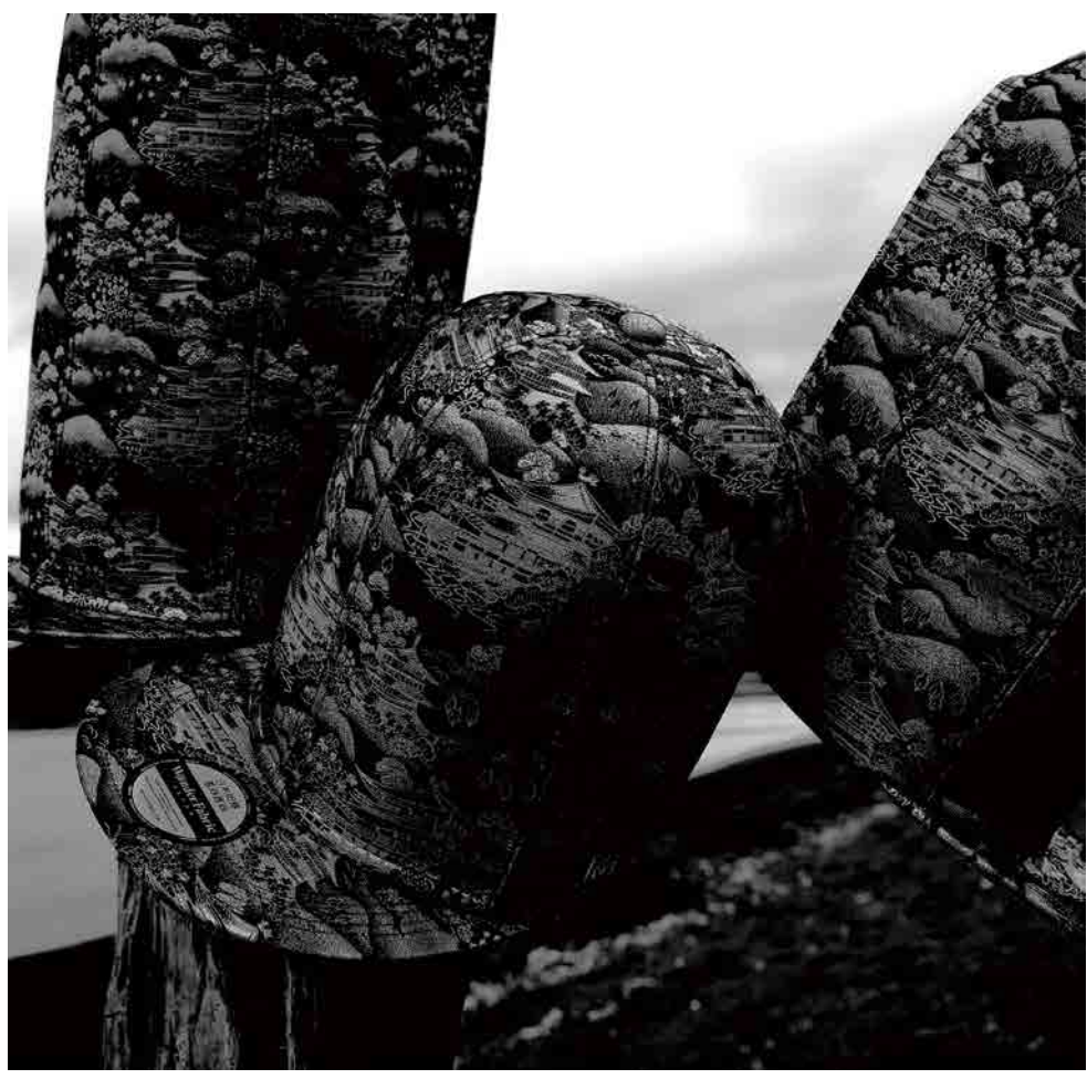
Visuals of the main image of the art cap.

W@nder Fabric® (Wonder Fabric) upcycles vintage kimonos and fabrics to create luxurious caps. With its unique designs, it redefines the possibilities of headwear. We are actively expanding into overseas markets, focusing on Europe and Asia, while growing our sales network.