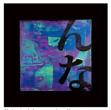
Abstract painting expression with "HIRAGANA" #Blue