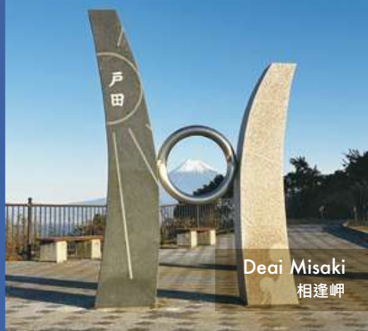
Deai Misaki 相逢岬