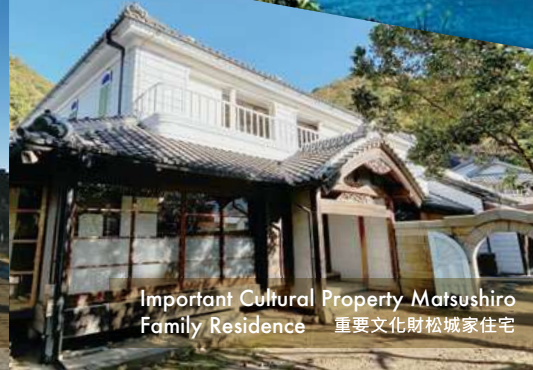
Important Cultural Property Matsushiro Family Residence 重要文化財松城家住宅