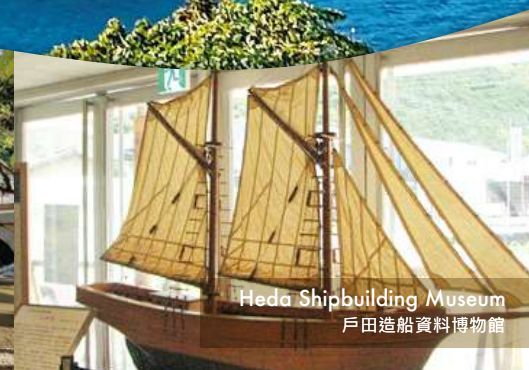
Heda Shipbuilding Museum 戶田造船資料博物館