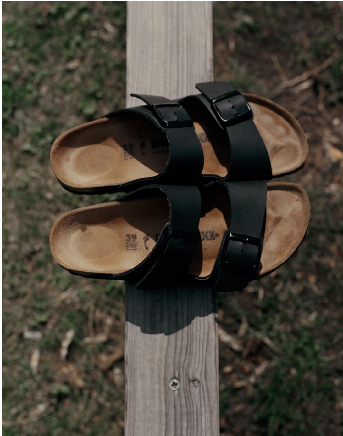
Photographed in Berlin, 2018.