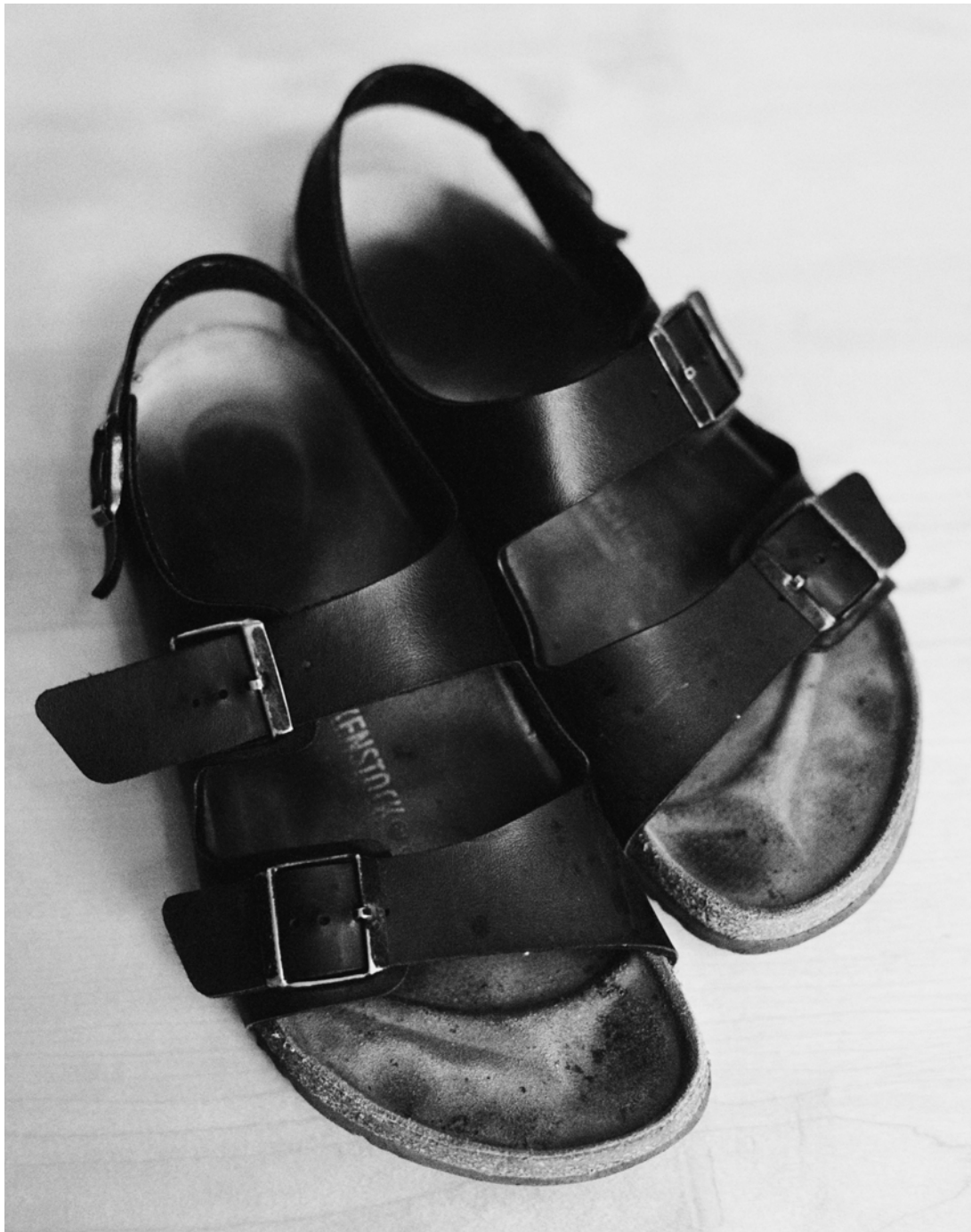
Photographed in Stanford, 2018.