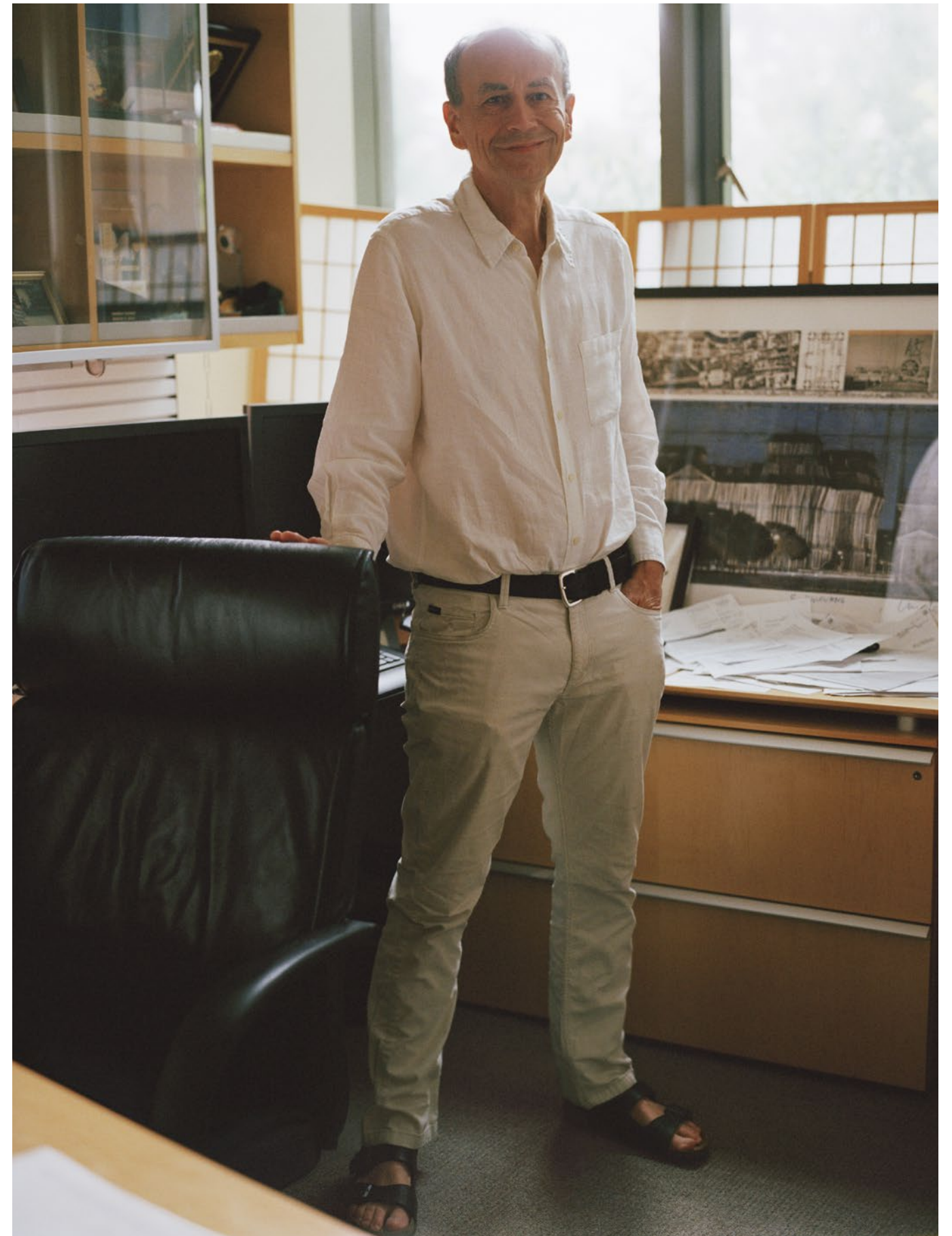
Thomas Südhof — biochemist, Nobel laureate in Physiology or Medicine wearing his black leather Milano purchased in 2018.