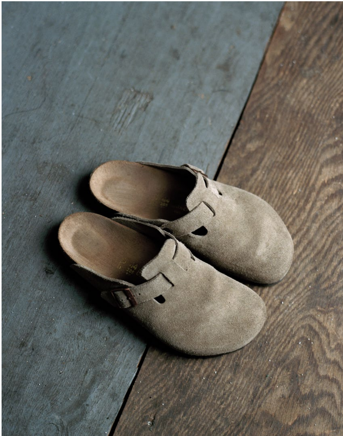
Photographed in New York, 2018.