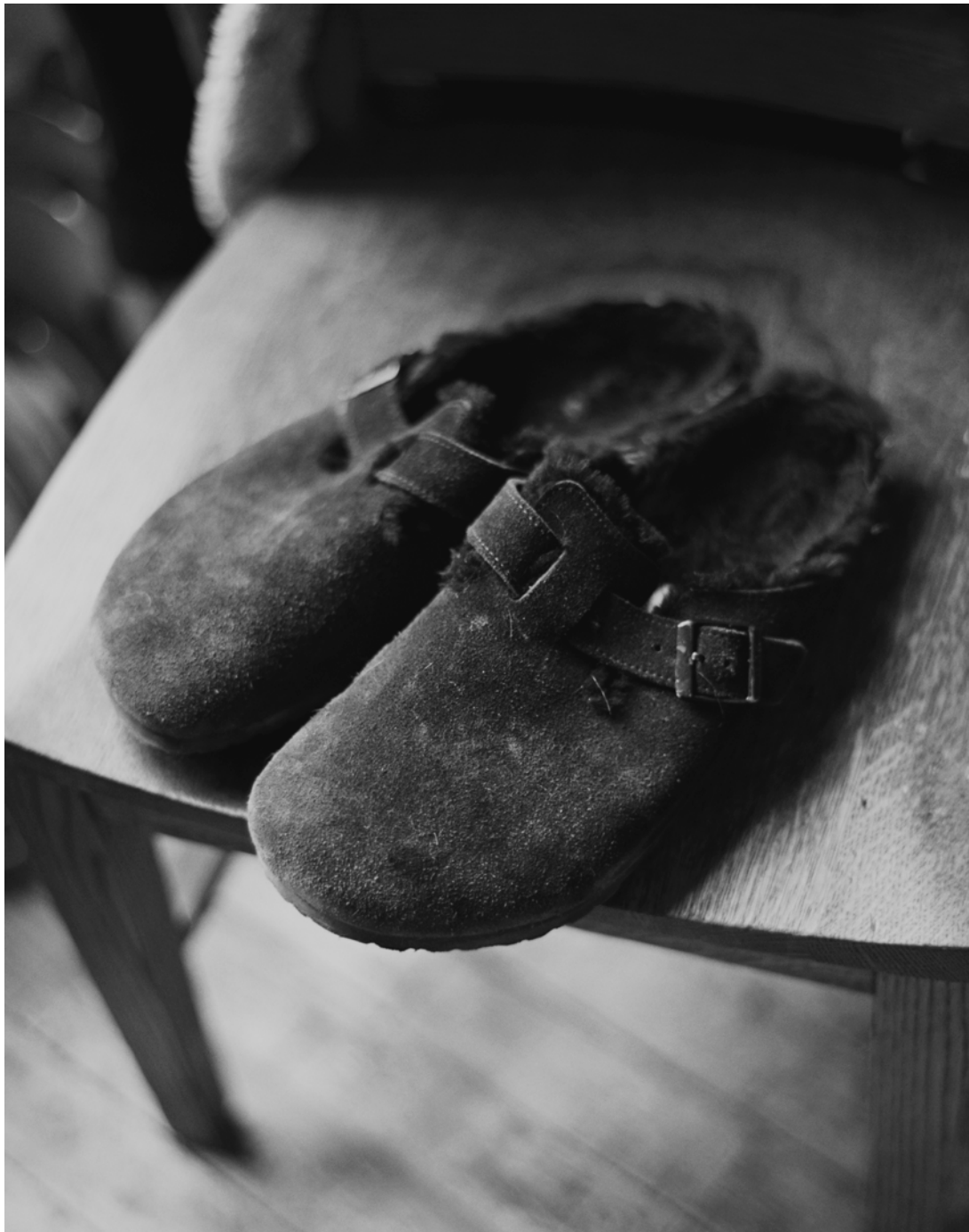
Photographed in New York, 2018.