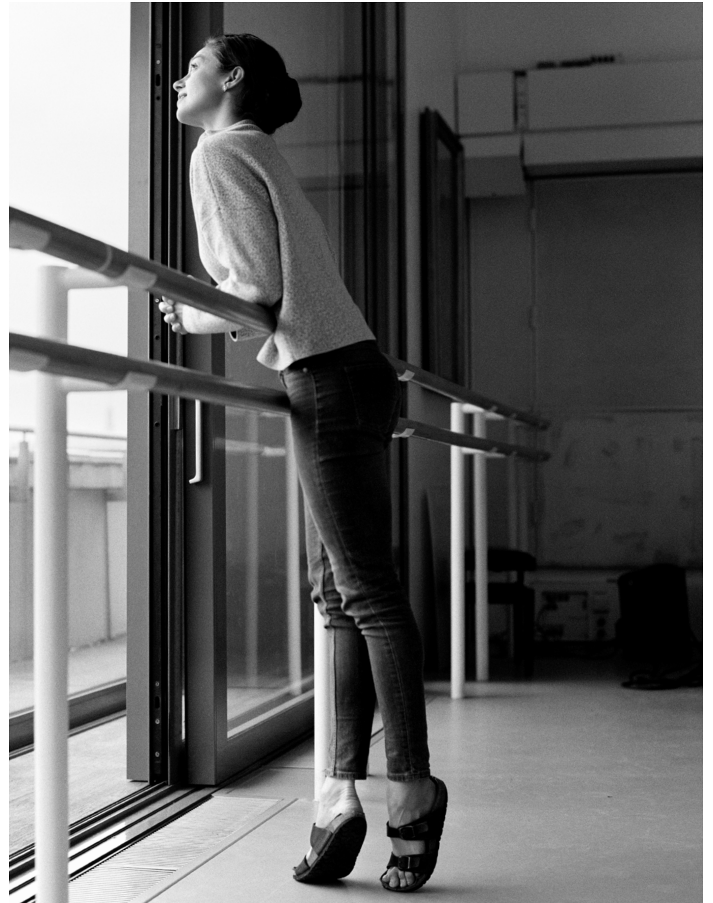
Romany Pajdak — First Artist of The Royal Ballet, London, wearing her black leather Sydney purchased in 2003.