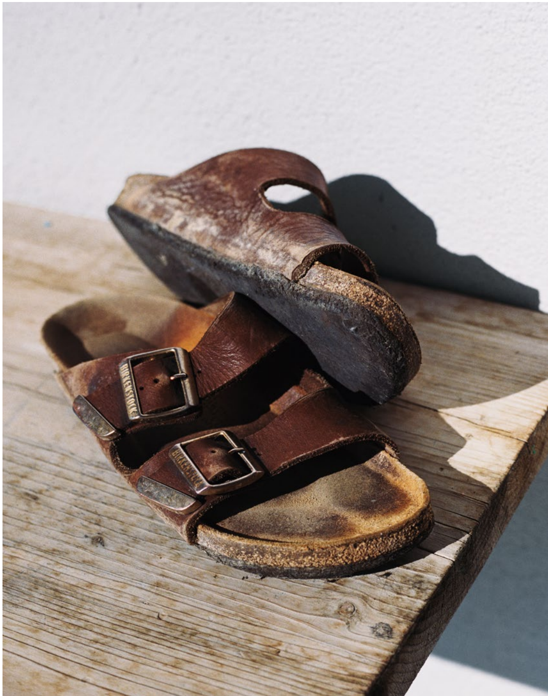
Photographed in Traunstein, 2018.