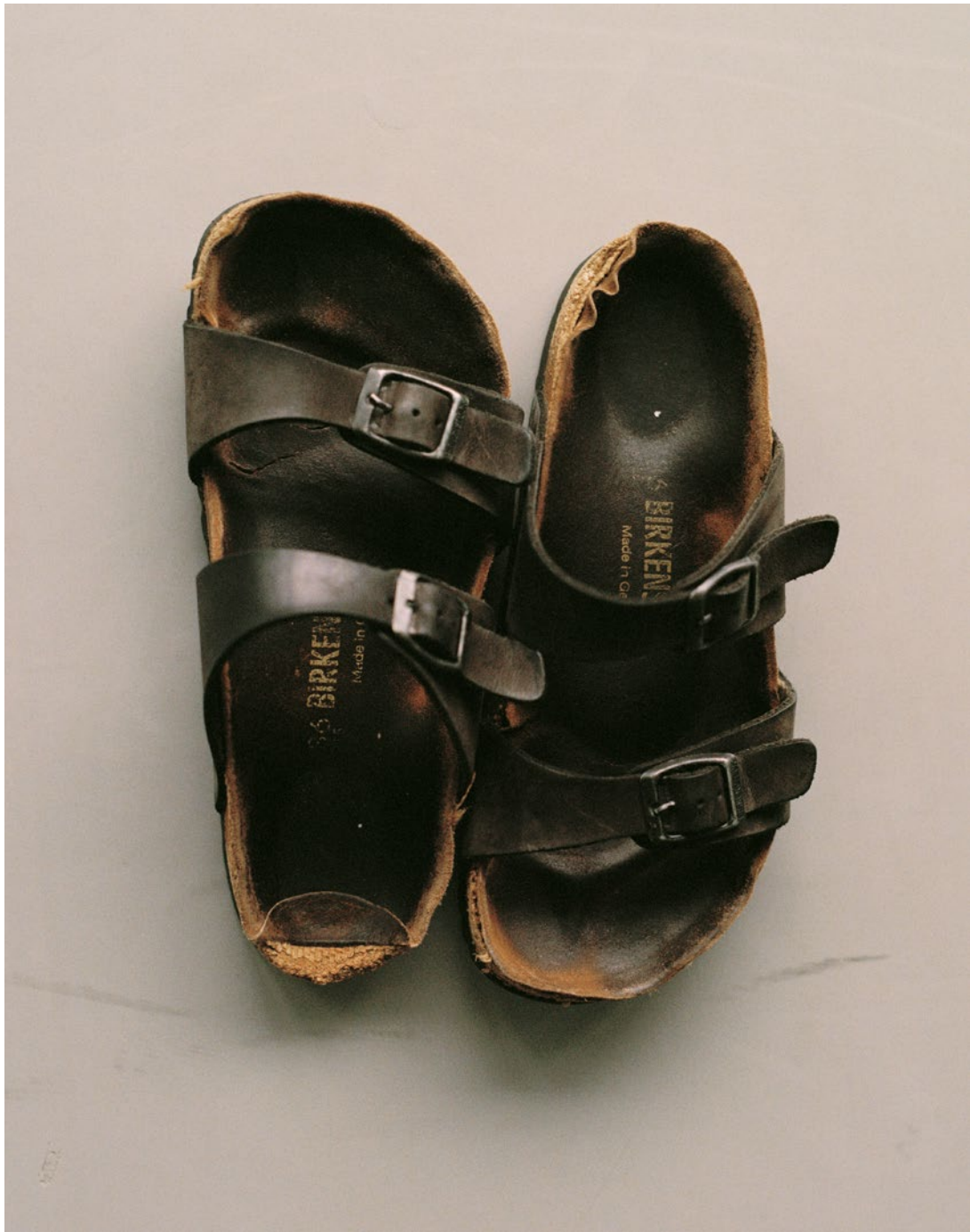
Photographed in London, 2018.