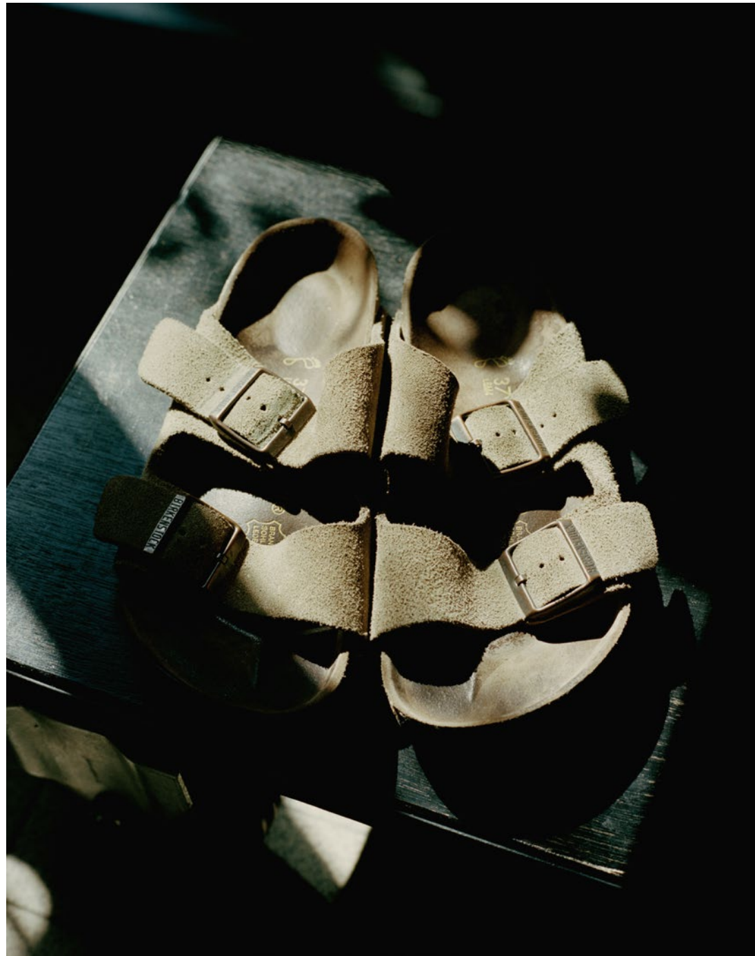
Photographed in Paris, 2018.