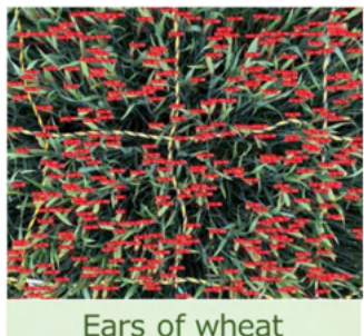
4. AI capable of Detecting Various Crops and Anomalies