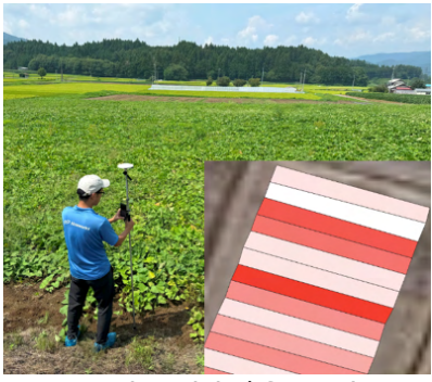
1. Precise Digital Surveying

This system is increasingly being adopted in various test fields for pesticide trials, varietal development, and seed production.