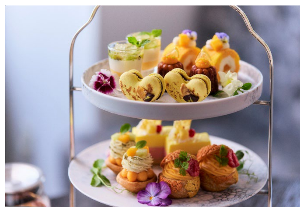
A limited-time afternoon tea celebrating the flavors of the season