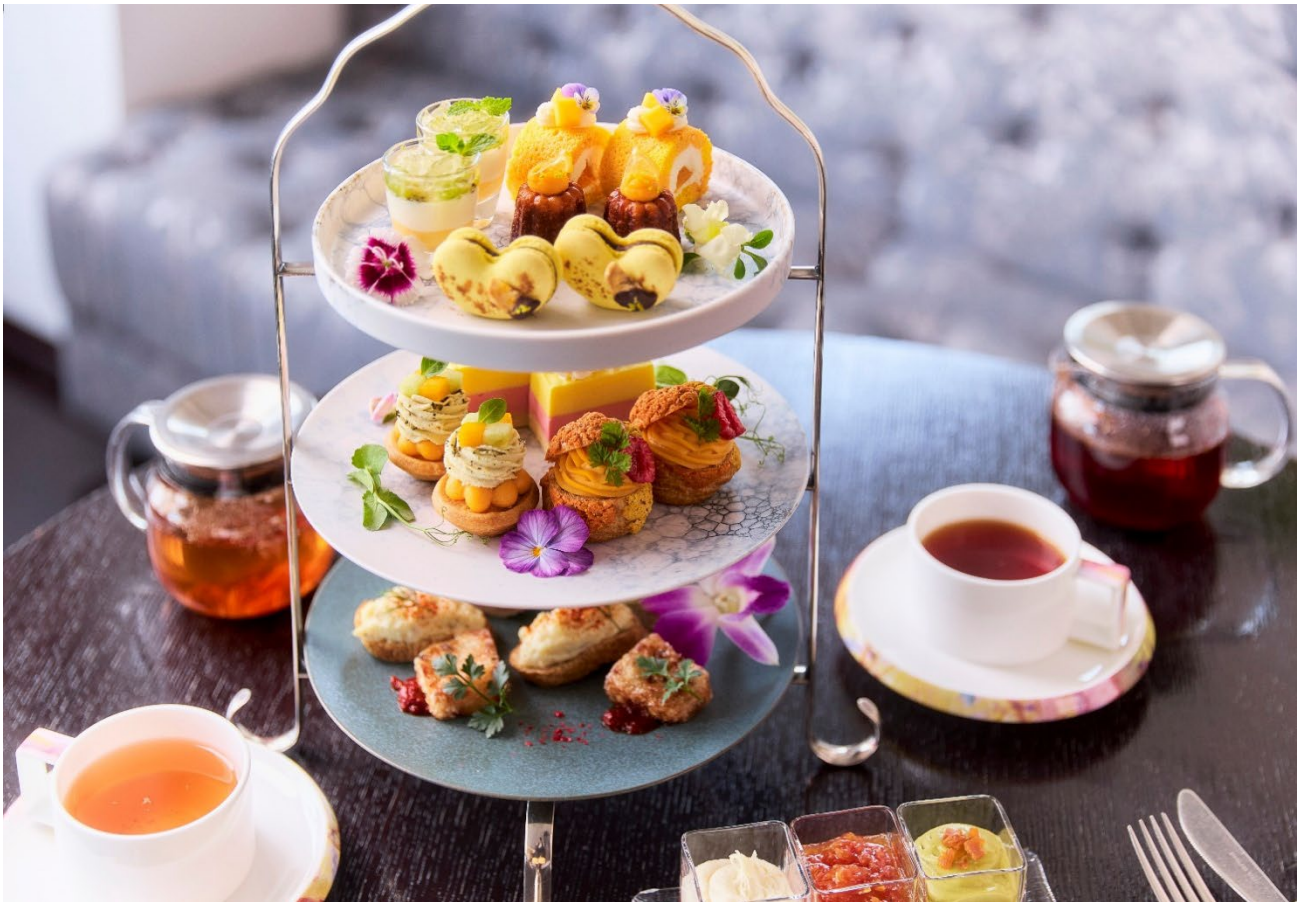
“Art Colours Afternoon Tea,” where summer fruits and colors come together