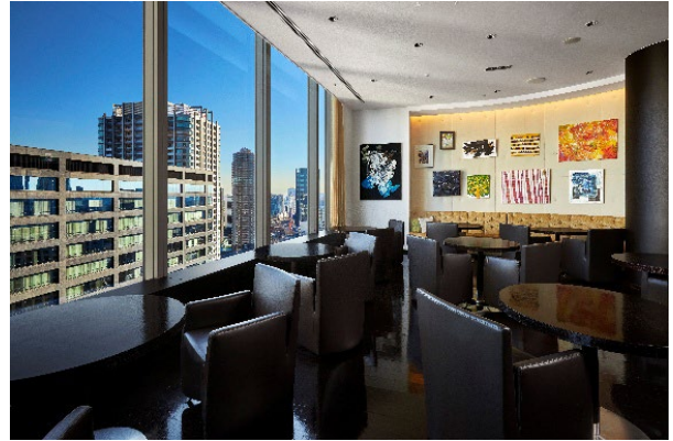
ART colours Dining on the 25th floor with Tokyo views and art