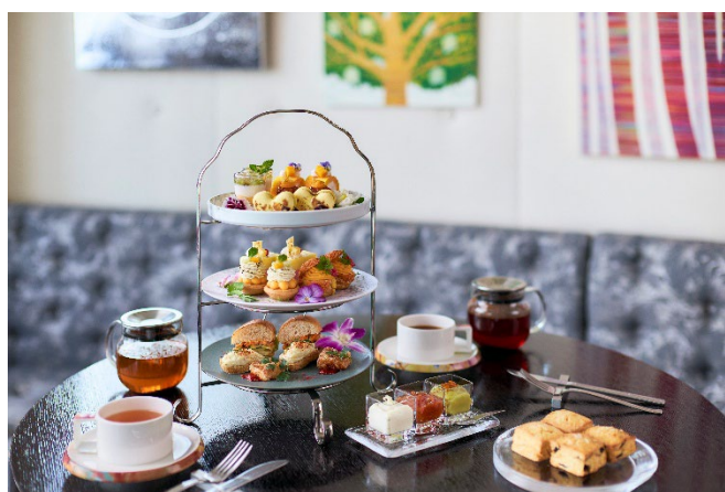
A relaxing summer afternoon surrounded by art