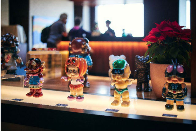
Exhibition view at the 25th-floor lobby