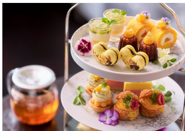
Melon and mango—a summer palette of fruit colors