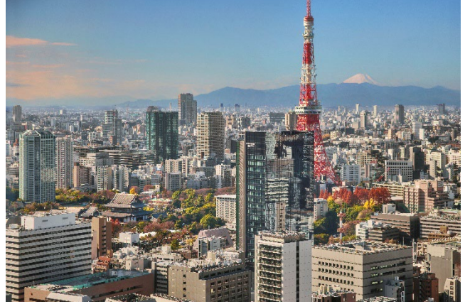
Panoramic views of Tokyo add to the afternoon tea experience