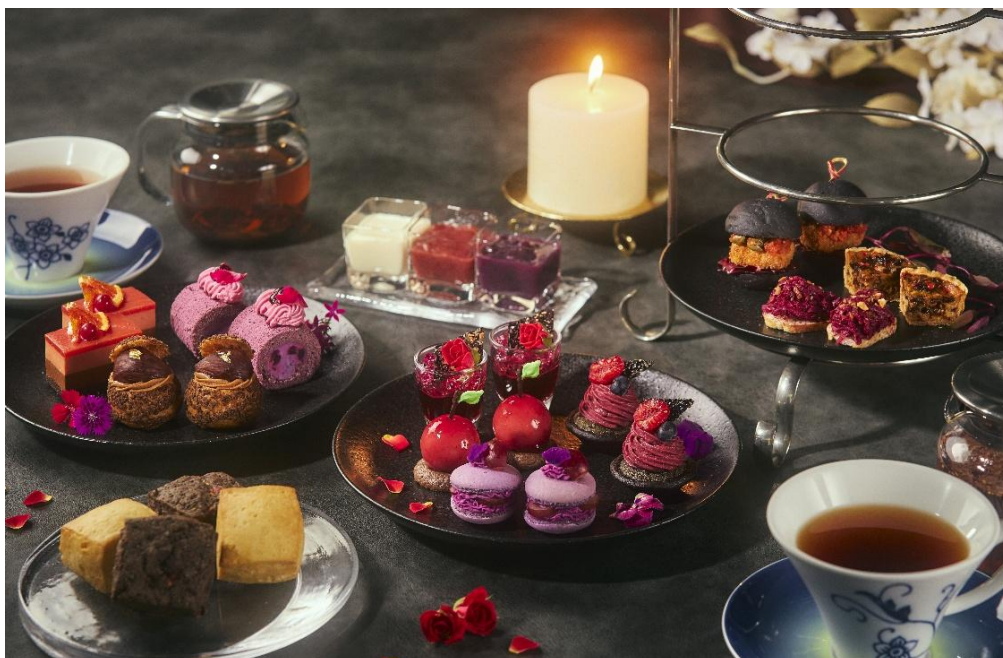
Gothic Grace Afternoon Tea *The photo shows a serving for two people. *The candles in the photo are not actually included in the set.

We invite you to savor an elegant afternoon where art and flavor intertwine—only at Park Hotel Tokyo.