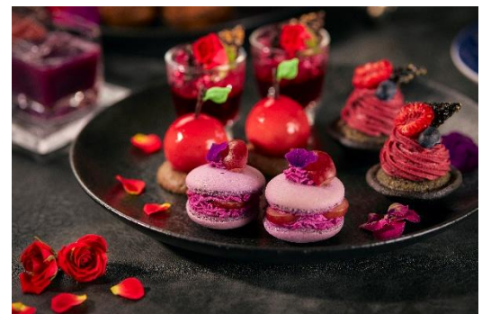
Afternoon tea one-tiered tray