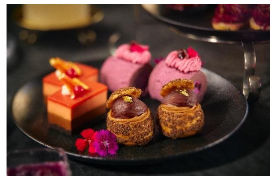
Afternoon tea two-tiered tray