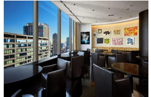
Art Colours Dining Inside the restaurant