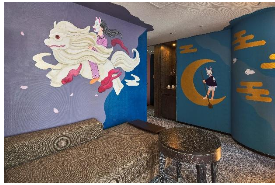
A sense of Asian aesthetics felt within the sacredness.

At the same time, the "mask"—a device that often conceals conflicts related to race and gender—also serves as a form of protection from the outside world, functioning both as a "shield" and a "symbol of oppression." While carrying this duality, the artist captures faint traces of salvation and hope that remain in contemporary society, expressing their own identity as an "outsider."