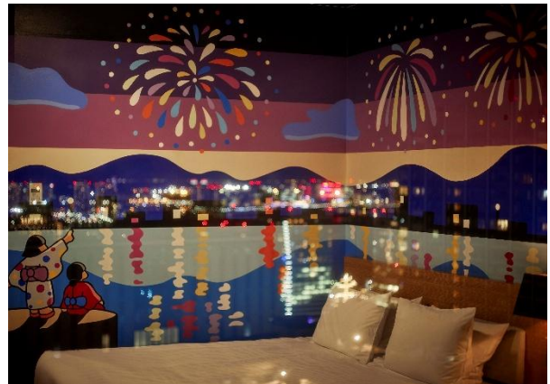
At night, the room becomes even more vibrant as the city lights reflected in the window complement the artwork beautifully.