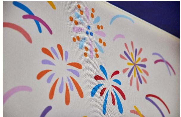
Charming patterns add a delightful touch to the room.