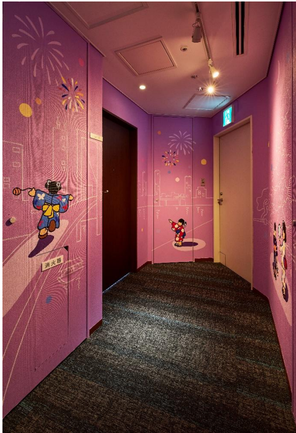
Feel the excitement of the fireworks extending all the way to the corridors. Enjoy the entire space to the fullest.