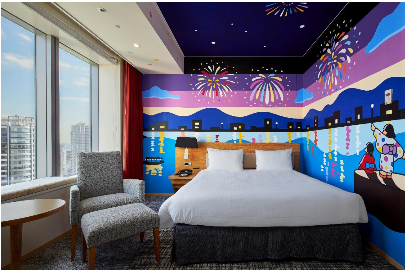
A room themed 'Fireworks' with a distant view of Tokyo Bay.