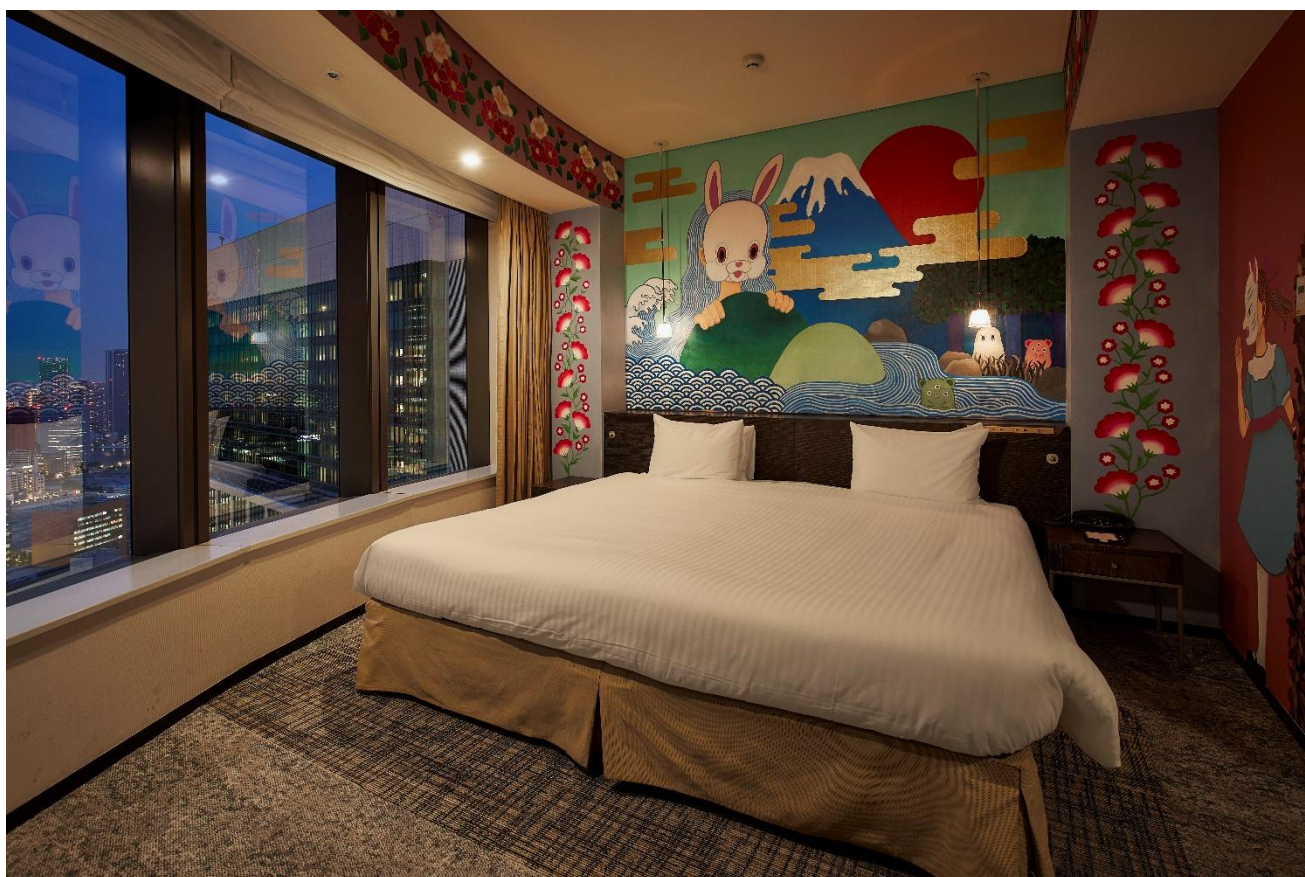
A rabbit mask painted on the bed’s headboard — a fusion of traditional Japanese culture and pop culture.