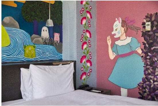
Playful touches can be found throughout the room.