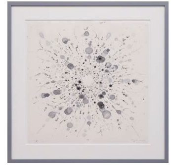
"Untitled (Lights) #25" 2024, Silver ink, blue sumi ink on Japanese

His major solo exhibitions include "Excavation Today" at The Museum of Modern Art, Gunma (2023). He has also shown in group exhibitions at Museum of Contemporary Art Tokyo (2019-2020); Yinchuan Museum of Contemporary Art, China (2016); Museum of Architecture, Wrocław, Poland (2015); Kunstraum Düsseldorf, Germany (2015); Maison de la culture du Japon à Paris, France (2015); 21st Century Museum of Contemporary Art, Kanazawa, Japan (2012); and Mori Art Museum, Tokyo (2010); as well as various other museums in and outside Japan. He has also collaborated with musicians and poets, and created numerous public artworks. His major publications include "Silver Marker: Drawing as Excavating" (2020, HeHe) and "Drawing: Point and Line and Plane to Tube" (2023, Sayusha). He currently works as an associate professor of Global Art Practice, Graduate School of Fine Arts, Tokyo University of the Arts, and as a visiting professor at The Eugeniusz Geppert Academy of Art and Design in Wrocław, Poland. http://hirakusuzuki.com/