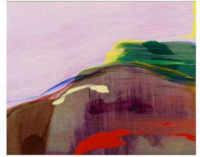
"The Scene I Once Saw" 2024, Oil on canvas