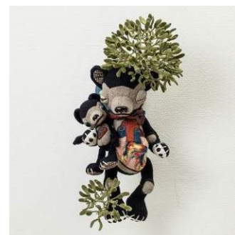
"Kissing under the mistletoe" 2020,

Wool material, synthetic cotton, hardboard joints, etc. Eyeball pottery (painting cooperation: Yuko Higuchi)