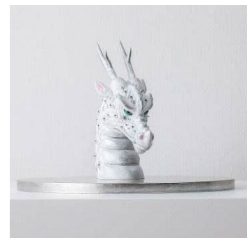
"Dragon of Rebirth" 2023, Ceramic clay, pigment