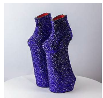
"Baby Heel-less Shoes," 2021, Cowhide, pigskin, dye, crystal glass, metal zipper