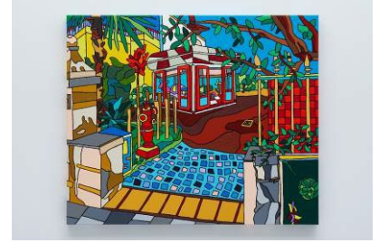
“Saint-Jean-de-Luz” 2024, Acrylic on canvas