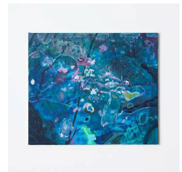
"Toru" 2022, Oil, acrylic on canvas

http://tomiokoyamagallery.com/artists/yuka-kashihara/