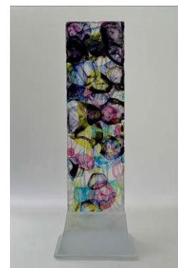
A Hundred Reflections of Shinjuku 2024, Glass