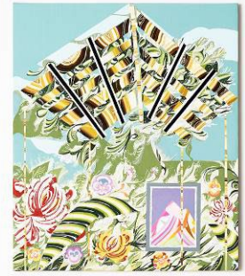
“Warm Sunny Day” 2022, Oil on canvas