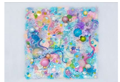
"TRUE COLORS -home- " 2013/2024, Japanese paper, sea glass, glass beads, gauze, cotton fabric