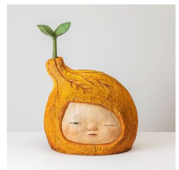
"sprouts of spring" 2022, Oil on camphor wood