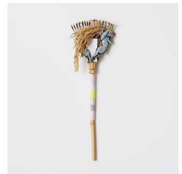
“Jump” 2022, Bamboo, ceramic, felt and ear of rice