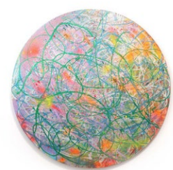
"cartwheel galaxy" 2022, acrylic, glitter, glass, spray on canvas

https://mtkcontemporaryart.com/artist/kito-kengo/