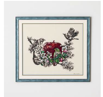
"apple blossom" 2022, Drawing papers, acrylic paint