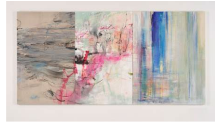
"View, 20 Pieces, 2020-21, No.02, May-Jun 2020" 2020, Pigment, acrylic, and other materials on canvas, ©Miyuki Tsugami Courtesy of ANOMALY