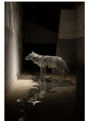
"makami" 2021, Copper wire