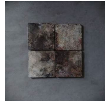
Dialogue series, "square plate" 2024 lacquer, wood, and other materials

https://www.instagram.com/iwata_toshihiko