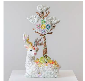
“Spring” 2022, Modeling paste, acrylic paint, resin and FRP