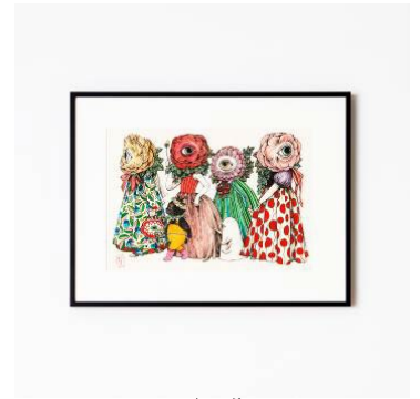
2022, Handmade Japanese paper, watercolor and pen