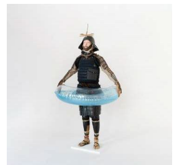
"RING AND MAN" 2024, Mixed media

https://gyokuei.tokyo/photo/album/414837