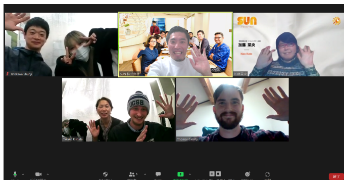
(Group photo after class)

In the course of such activities, we became interested in Toyooka City through a presentation on attracting IT companies, and Toyooka City referred us to a non-profit organization, "Nihongo Toyooka Aiueo", which supports the lives of foreigners and children with foreign roots living in the community. One of the support activities is a "Japanese language class" where Japanese spouses, ALTs (assistant language teachers), CIRs (coordinators for international relations), children with foreign roots, and technical intern trainees learn Japanese. Since the classes were based on face-to-face operations, it was sometimes difficult to hold classes due to the COVID-19 pandemic and weather conditions. Now that they are actively considering the digitalization of Japanese language classes, they showed interest in SUN's efforts, which led them to experience an online Japanese language class utilizing the "KURASHI STUDY" Japanese language learning app.