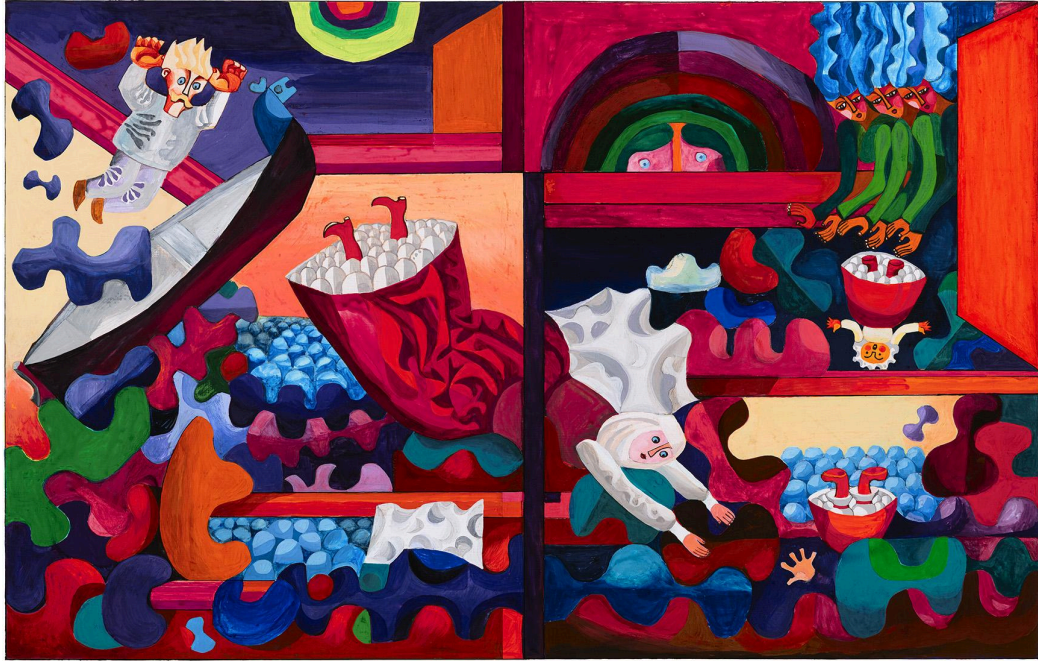
Birutė Zilytė Laumiukas 1970