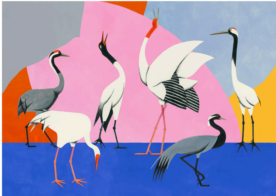
Roberts Rurans _Cranes_ (2020)

Beyond observation, Baltic Island serves as a platform for creative exchange. The two-week agenda includes industry panels, networking sessions, and hands-on workshops designed to connect Baltic creators with Japanese studios and publishers. The programming also features a charity art auction dedicated to supporting Ukrainian refugees in Japan—a clear demonstration of art functioning as actionable soft power.