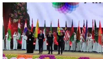
Flag handover at the closing ceremony