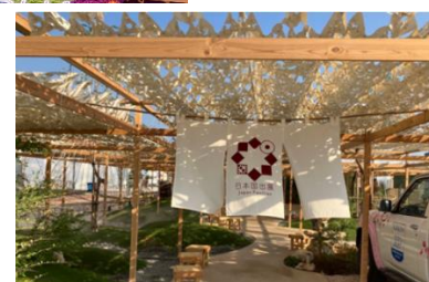
Japanese Government Exhibition