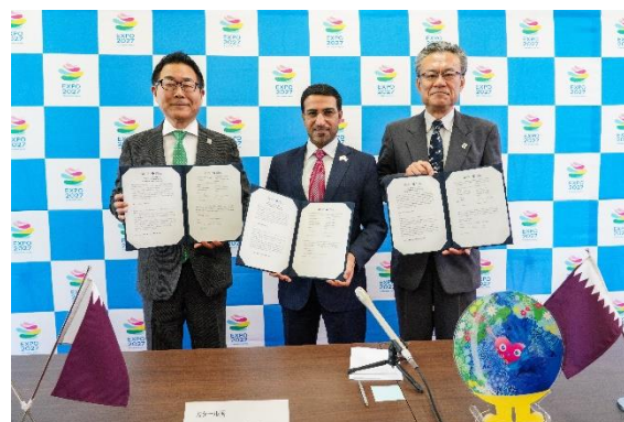
Commemorative photo after the signing