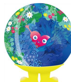
Official Mascot Tunku Tunku