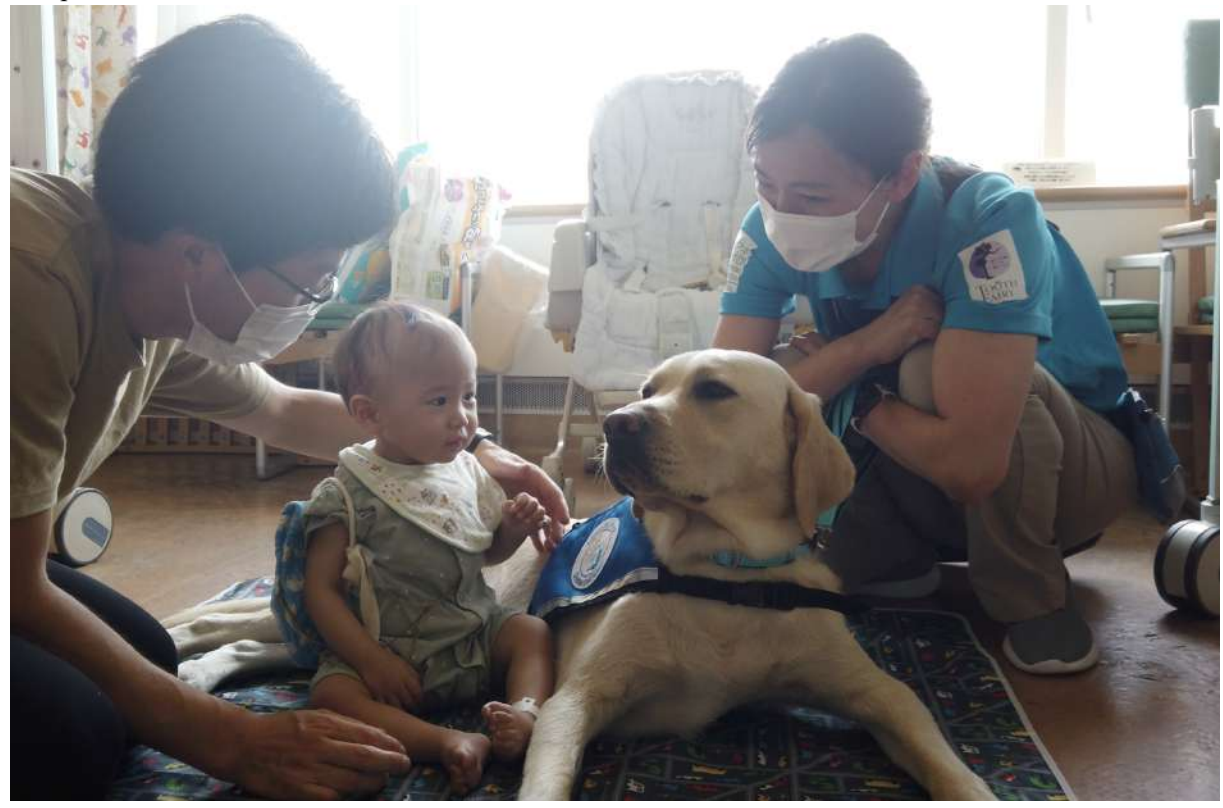
Enjoying interaction in the hospital ward

The Hospital Facility Dog Program is an animal-assisted therapy program that pairs a "Hospital Facility Dog," a dog that has received professional service dog training for roughly 1.5 years to work in a children's hospital, with a nurse or other healthcare professional who has completed training to become a professional dog "handler" in a children's hospital environment. This program supports hospitalized children and their families through a variety of interactions with the dog team - from friendly visits and cuddles, to rehabilitation activities and support during medical procedures.