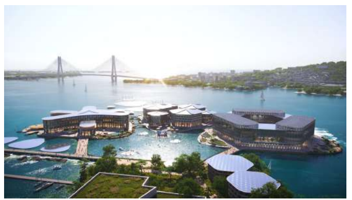
South Korea (Oceanix Busan) Architects:BIG-Bjarke Ingels Group