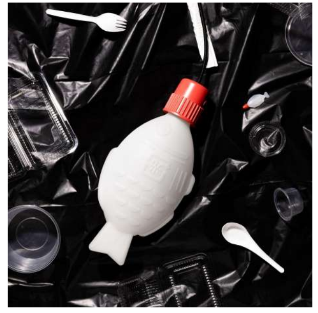
Australia 〈Light Soy〉 Designer: Heliograf

Denmark <Mater, OCEAN DINING CHAIR> Designer: Nanna Ditzel Provider: Scandinavian Living